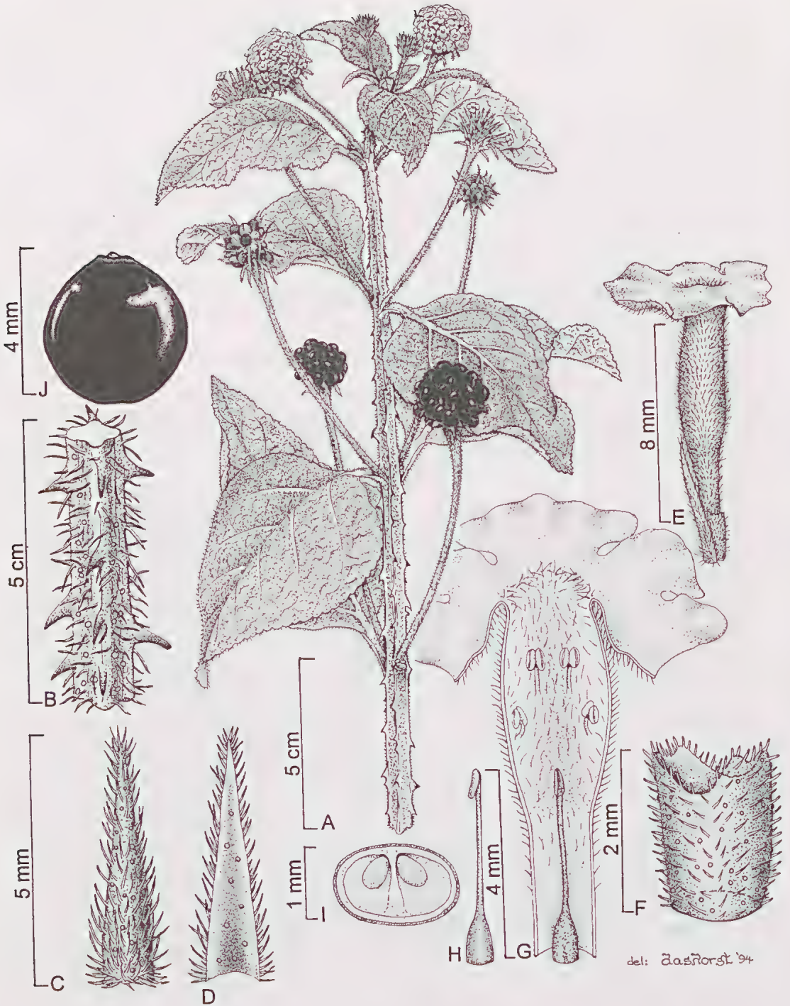
Fig. 1. Lantana camara L. var. camara (A-J, W.J. Jones 1635: CANB). A, habit sketch of a branch with flowers and fruit; B, portion of stem showing spines and hairs; C, abaxial view of bract; D, adaxial view of bract; E, flower with bract; F, calyx showing two shallow lobes; G, longitudinally cut open corolla showing androecium and gynoecium; H, gynoecium showing oblique stigma; I, transverse section of ovary; J, fruit.